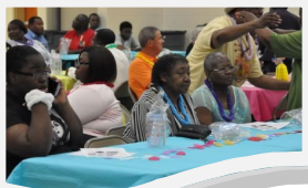
Members Celebrating 51 Years!

Members celebrated with great food, and fun. Many members won terrific door prizes and all the children received backpacks.