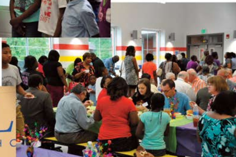
Members enjoying the meeting